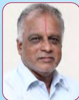
Prof. MS Accounts